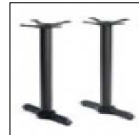
Table Top & Tbase Shipped Separately On Site Assembly by Customer or Pre Arranged with Davidson Furniture