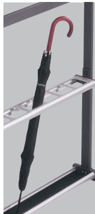
Optional umbrella holder