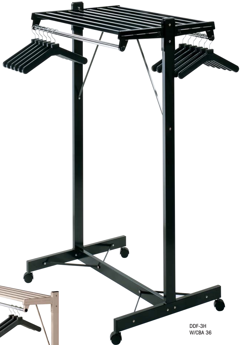
DDF-3H W/CBA 36

Hanger style features 1" diameter chrome rod that accepts open hook, closed loop, ball or T-top hangers with receptacles (sold separately). Hook style includes charcoal gray K73 vinyl coated steel triple prong hooks. Racks available in powder coated steel finishes of Medium Gray, Sandstone and Black.