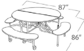
TABLE SHOWN 59T062960RD-B4