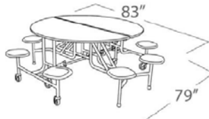
TABLE SHOWN 59T062960RD-S8