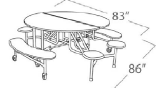
TABLE SHOWN 59T062960RD-B2S4