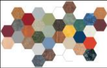
Full Spectrum of WILSONART laminate