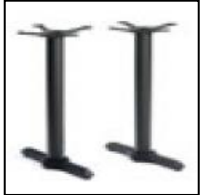
Table Top & Tbase Shipped Separately On Site Assembly by Customer or Pre Arranged with Davidson Furniture