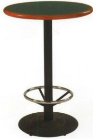
Stand Up 42" High Table