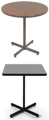
Stand Up 42" High Table