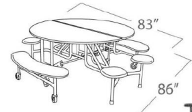
TABLE SHOWN 59T062960RDB2S4