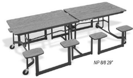
NP 8/8 29"