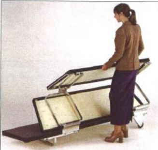
SIMPLE UNITIZED DESIGN