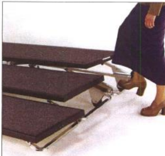
GAS-SPRING LIFT ASSIST