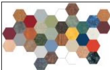
Full Spectrum of WILSONART laminate