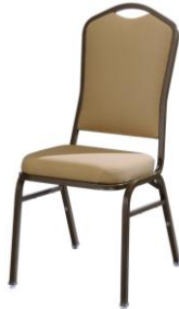
594 (Omega I Series)