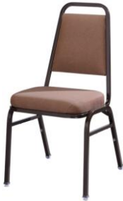
500-SB (Alpha Series)