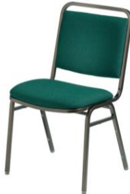
677 (600 Series – Convention Stacker)

Ideal for banquet, meeting and convention