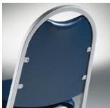
Exposed Back Tab