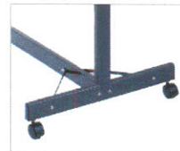
CASTER BASE ASSEMBLY