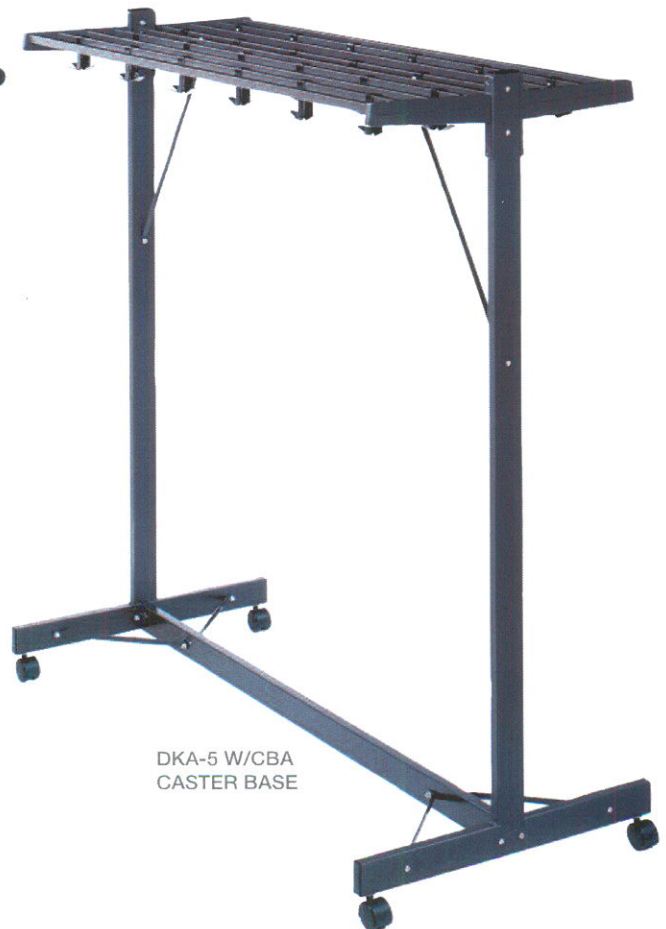
DKA-5 W/CBA CASTER BASE