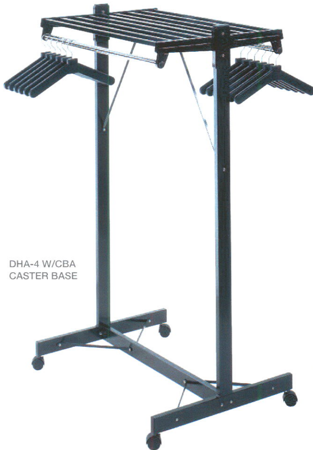
DHA-4 W/CBA CASTER BASE

Floor standing single and double faced coat racks are available in 3, 4 and 5 ft basic length. Add-on units in 3, 4 and 5 ft lengths make any lengths over 5 ft possible in 1' increments. Chrome plated 1" o.d. hanger rod accepts the hanger of your choice on hanger style SHA (single sided) or DHA (double sided). Hook style units SKA (single sided) or DKA (double sided) are furnished with K73 vinyl coated steel triple prong hooks. Optional locking casters with shock braces provide easy mobility (Model CBA). All floor standing racks are one shelf high.