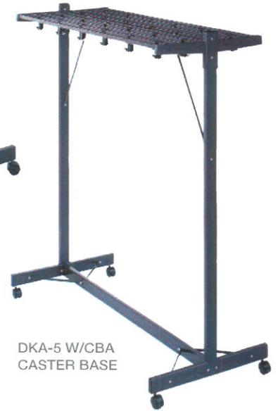
DKA-5 W/CBA CASTER BASE