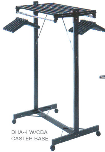
DHA-4 W/CBA CASTER BASE

HOOKS: Choose from manufacturers' standard colors of Black, Charcoal Gray or Sandstone vinyl coated steel.